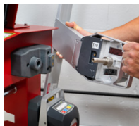
Side supports house and recharge measuring head batteries