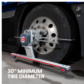
30" MINIMUM TIRE DIAMETER