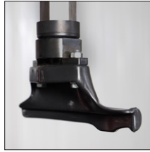
PLASTIC TOOL HEAD VSG800A60 Tool head with support