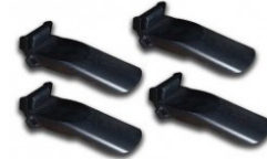
VSG800A6KIT Clamp Protectors / 24" - 26" (4 pcs)