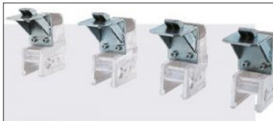
SMALL WHEEL ADAPTER VSG800A111KIT Reduces clamping capacity to 8" for ATVs and lawn equipment tires. - requires VSG800A107 wheel clamps