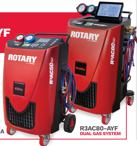
R3AC80-A YF DUAL GAS SYSTEM