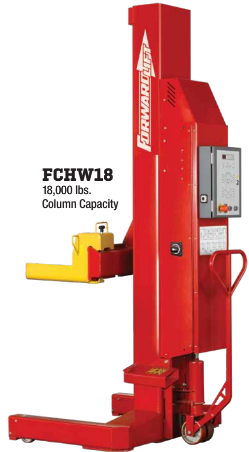
FCHW18 18,000 lbs. Column Capacity