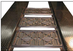
FOUR (4) DRIP TRAYS