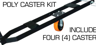
POLY CASTER KIT