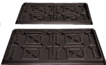
Includes four (4) Drip Trays