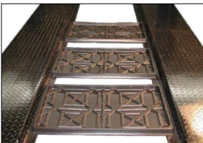
FOUR (4) DRIP TRAYS