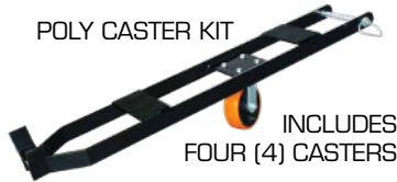
INCLUDES FOUR (4) CASTERS