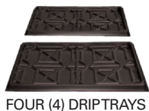
FOUR (4) DRIPTRAYS